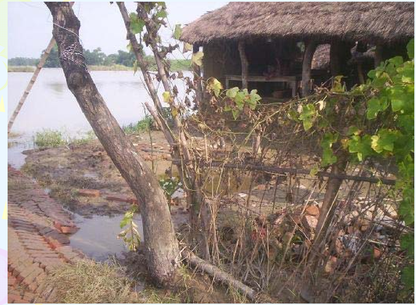
Bihar Flood 2007-SSVK