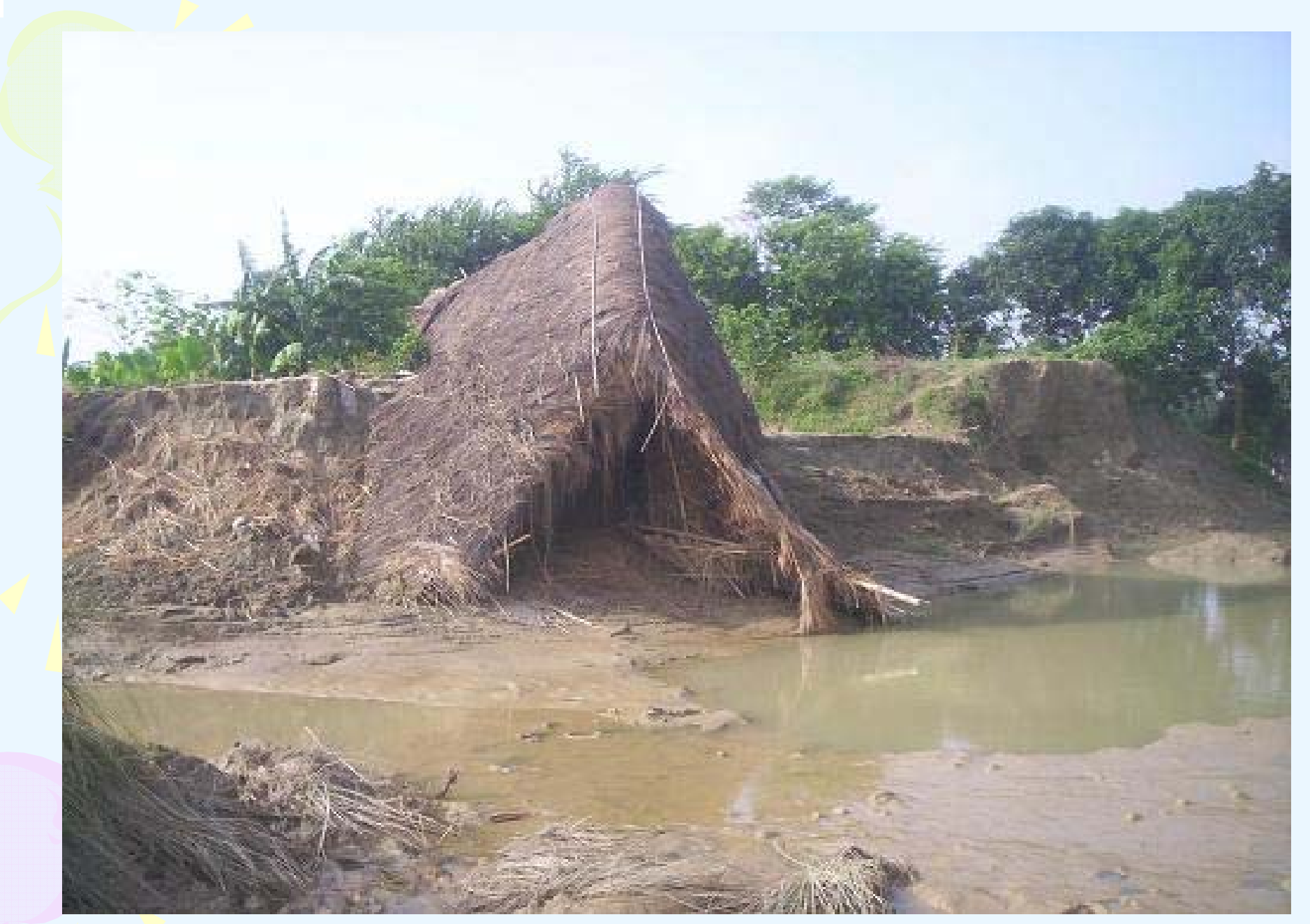
Bihar Flood 2007-SSVK