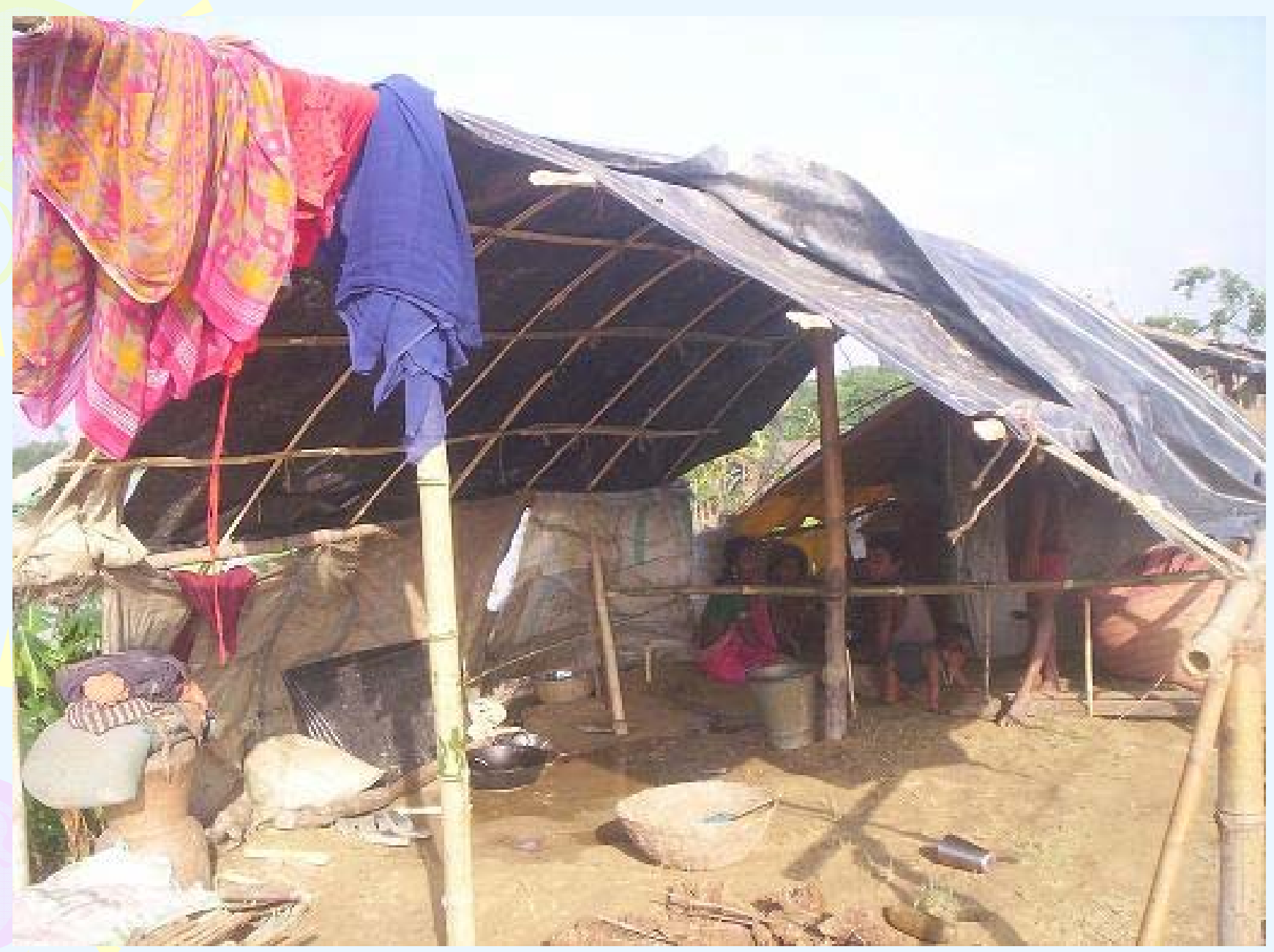
Bihar Flood 2007-SSVK