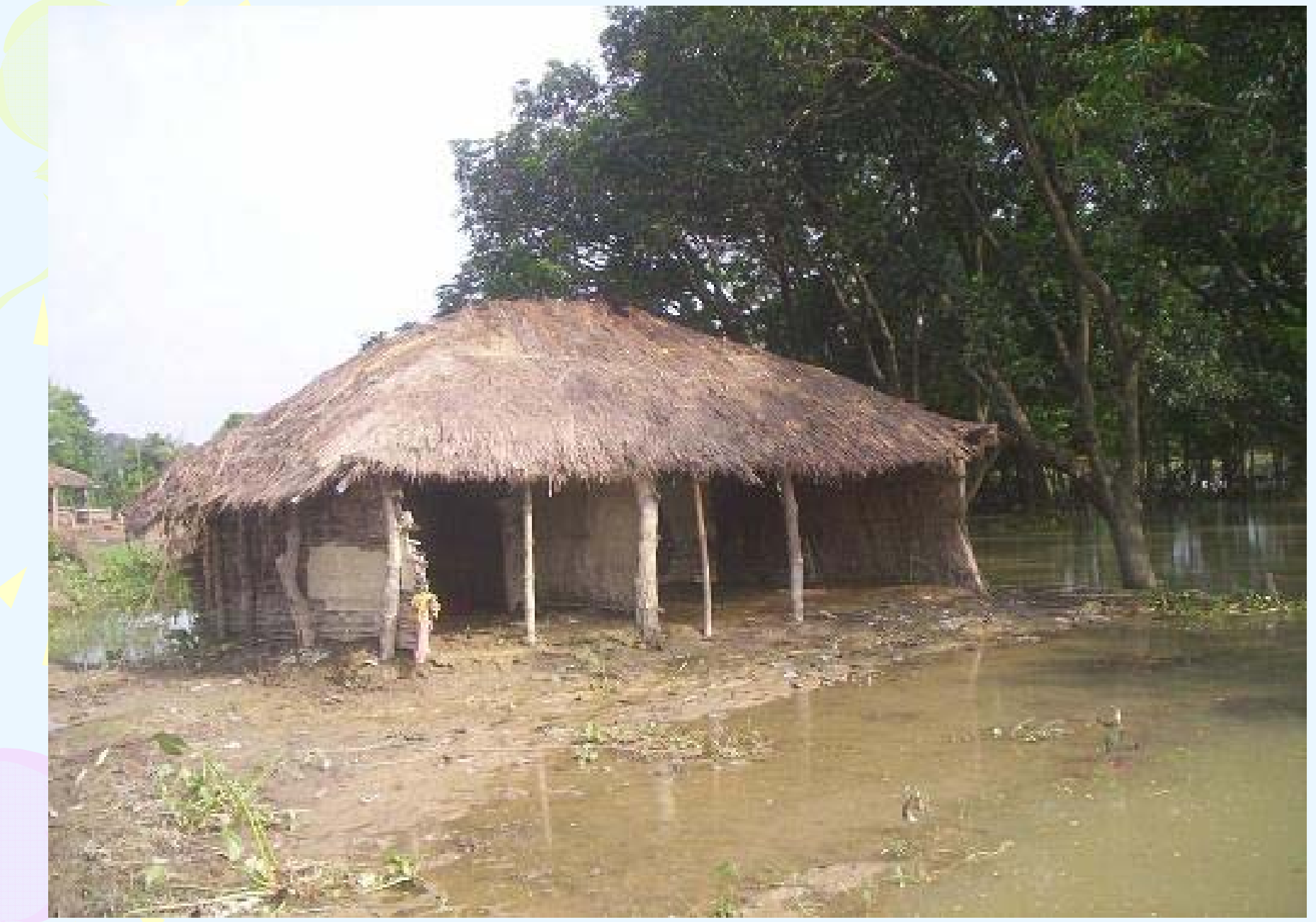
Bihar Flood 2007-SSVK